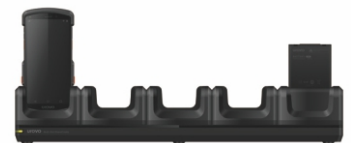
5-slot Share Cradle