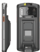
Fingerprint Battery Cover