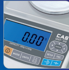
Large Display with Blue Backlight