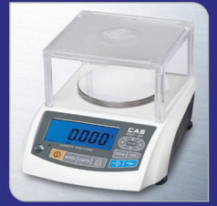
Small Tray & Windshield for protection