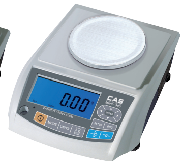
MWP Low Capacity