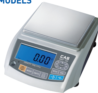
MWP High Capacity