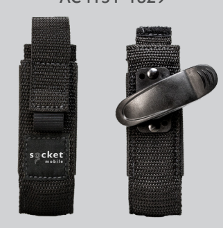
Safe and accessible placement