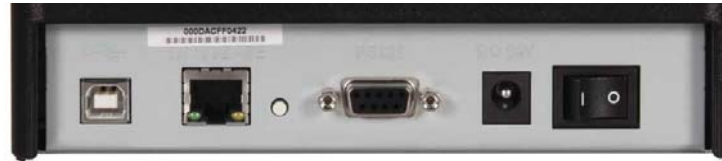
On-board LAN, USB and Serial interfaces