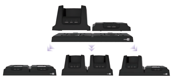
Modular Charging and Communication System

The 8600 series' flexible design comes with swappable keypads which give the 8600 series the power to easily swap between 29 or 39 keys when it is necessary. The 8600 series also comes equipped with a modular system which provides various combinations of charging / communication cradles and battery chargers. This makes the initial configuration modification very simple. This flexible design will also assist in reducing the inventory level while providing more cost-effective re-configurations for end users. Additionally, it will also make repair and replacement process easier and quicker.